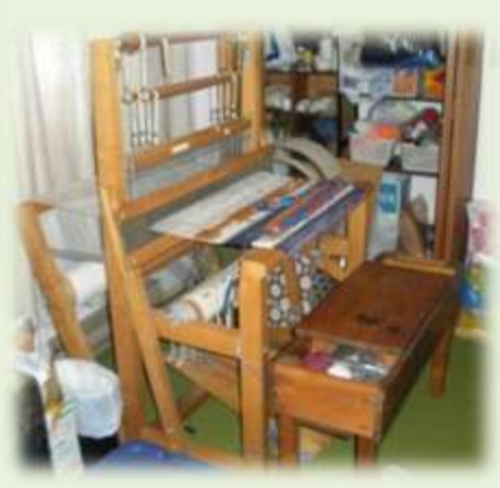
28" Leclerc Fanny