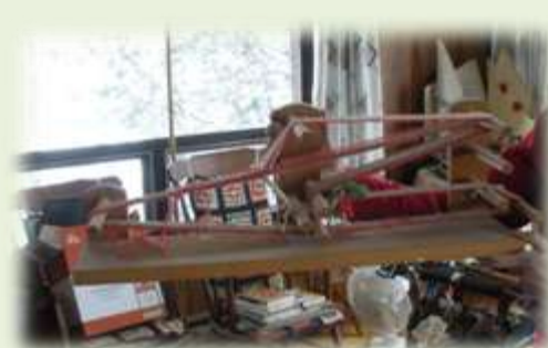
Inkle Loom / Warping Board

Call 613 692-4191 after March 4th for details