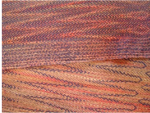
Scarves by Francesca Overend