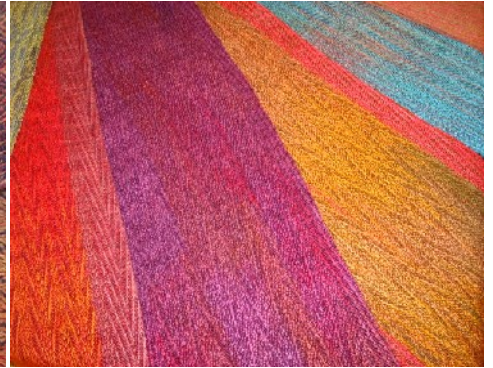
Scarves by Francesca Overend