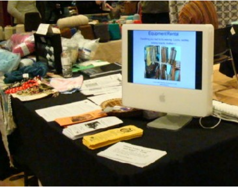
Guild display table