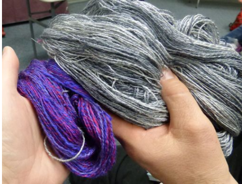
Ann's handspun silk