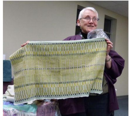
Ann's cushion covers