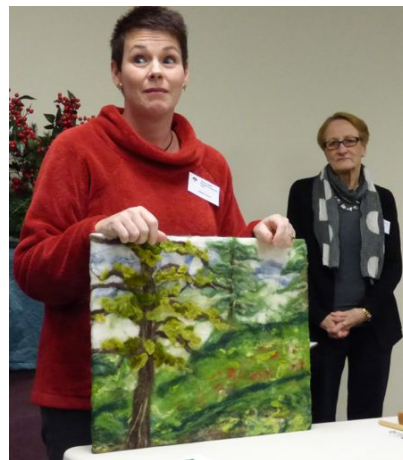
Nancy's felted landscape