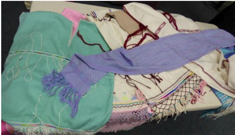
Katrina's backstrap weaving