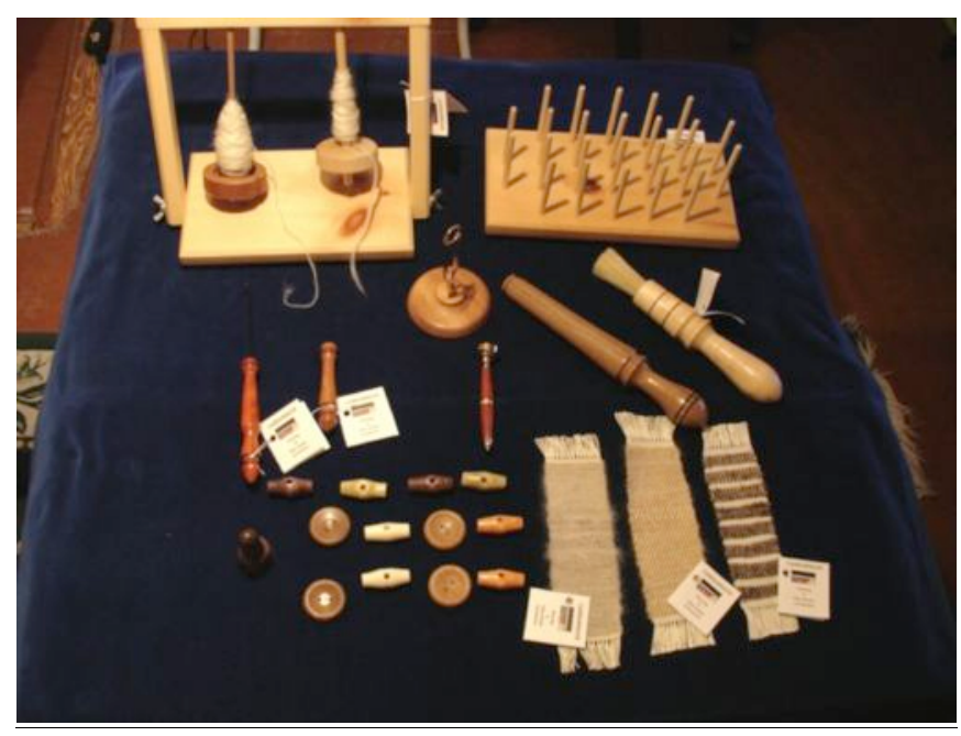
Top left to bottom right

Drop Spindle Plying Jig – holds 2 loaded drop spindles so you can then ply yarn off them. $20 Bobbin/Thread Holder – holds shuttle bobbins and thread spools of all sizes. $32