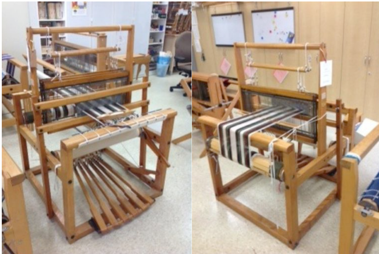
45-inch Clement loom with bench -- 4-harnesses + reed + shuttle $450