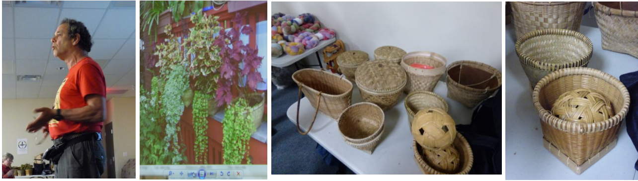
Jay Ellen Bogen's presentation on Indonesian baskets