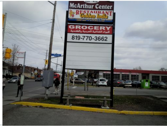
New Smoking area with bench