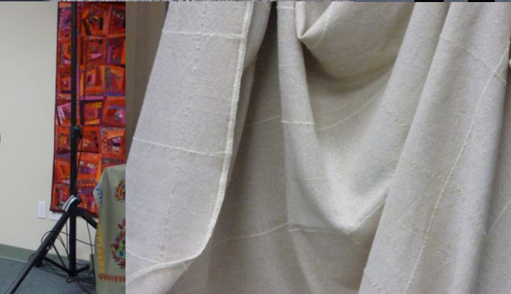
Kathleen's satin- bound 100" loom blanket; Mandy's 100" loom blanket with boucle window pane sections; Ann's felted shawl; Melanie and Patty's scarves.