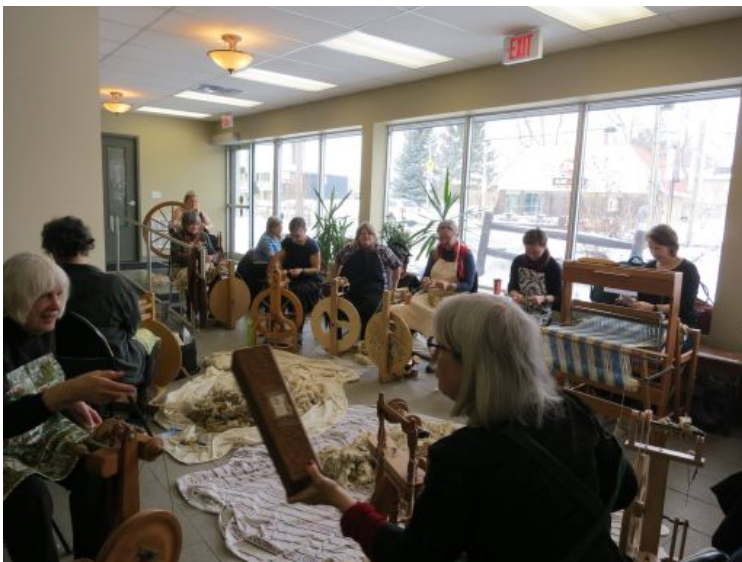
Photos from the Sheep-to-Shawl, in progress

Next meeting takes place Monday March 6, 2017, 7:30pm.