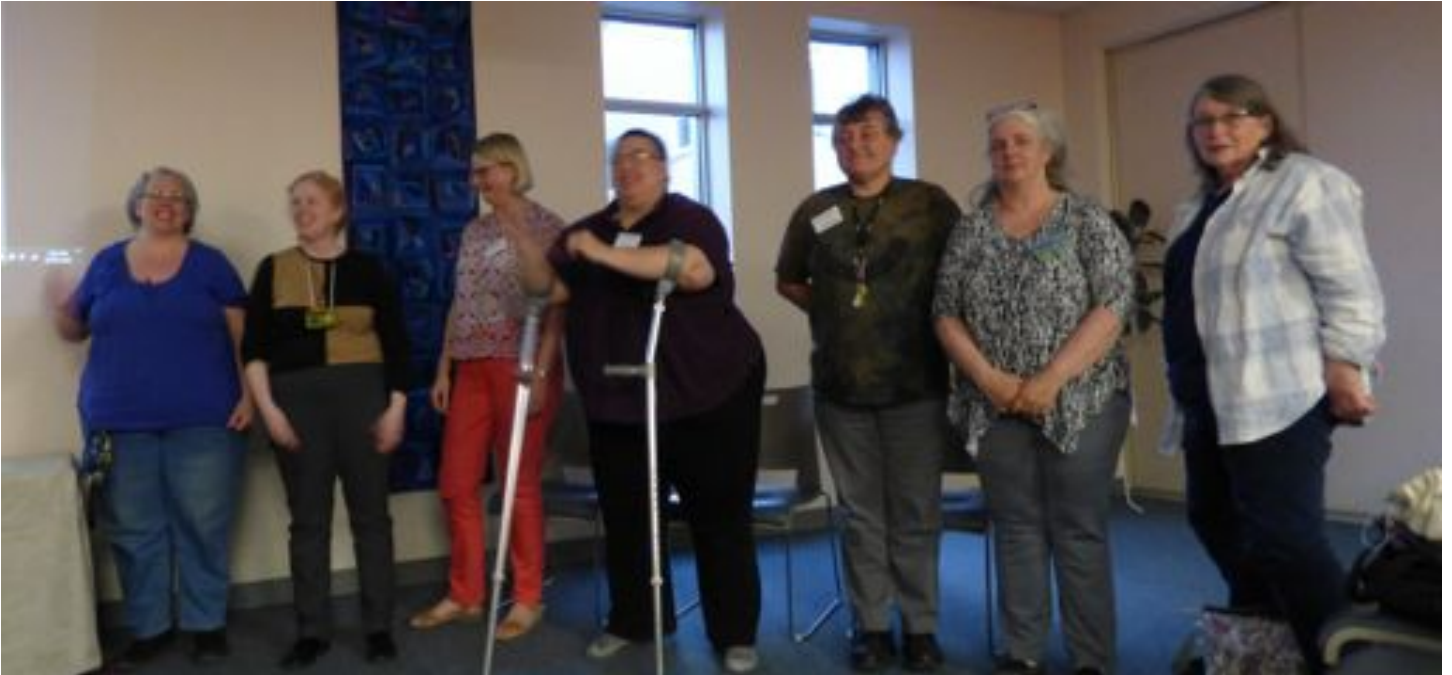
Studio Team; Programming Team (below)