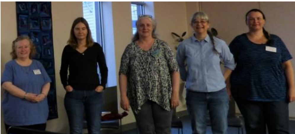
Public Relations Team