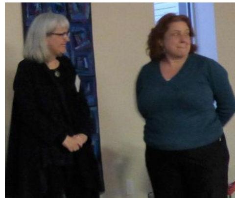
Studio Team (continued); Grants and fundraising