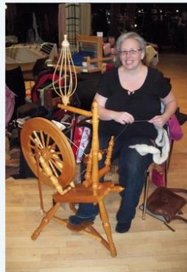
Robidue Saxony wheel in Birds eye maple.