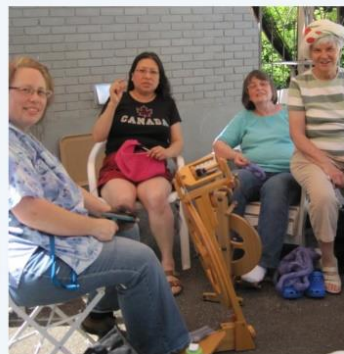
Spin In at Arora's Summer 2010.