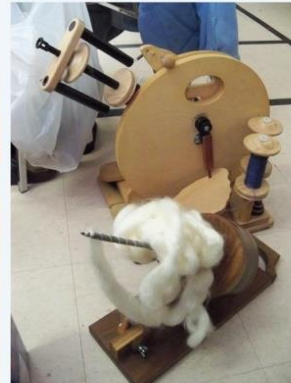
Merlin tree Road bug travel wheel and a Kick Spindle by Alvin Ramer. 2013