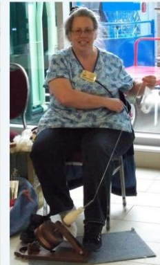
Kick Spindle at the farm show demo 2013