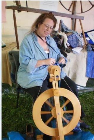
Folding Ledrum and diminutive Great Wheel at the carp fair 2008.