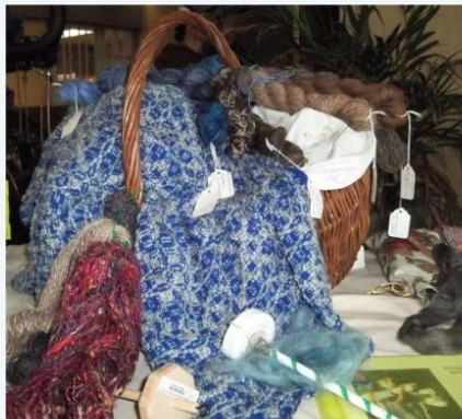
Spinning basket with cover. This Overshot pattern is woven in cotton with the pattern thread a grey slub-cotton, set at 12epi. Also shown are some of my spinning samples and spindles used at demos.

She acquired her first spinning wheel around 1998, an old Ashford traditional, shortly after finding kittens. (The kittens were not amused.) she discovered she enjoyed spinning on a wheel and by then had lost most of the irritation from working with wool. One wheel became two and over the years the heard grew to about 16. all but one are functional and two are electric. Don't tell the wheels, but her favorites are the Lendrum Rook, the Merlin tree Road bug and the Ashford Traditional.