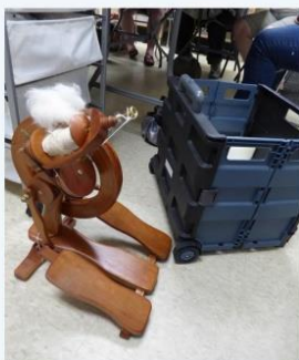
Holiday Wheel, small travel wheel that fits in a trundle box at a 2018 Guild Social